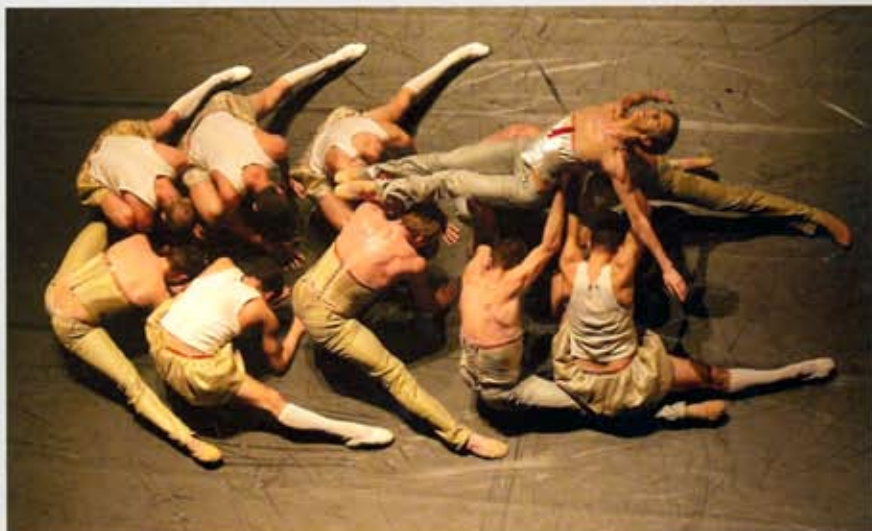
Altro Canto 1