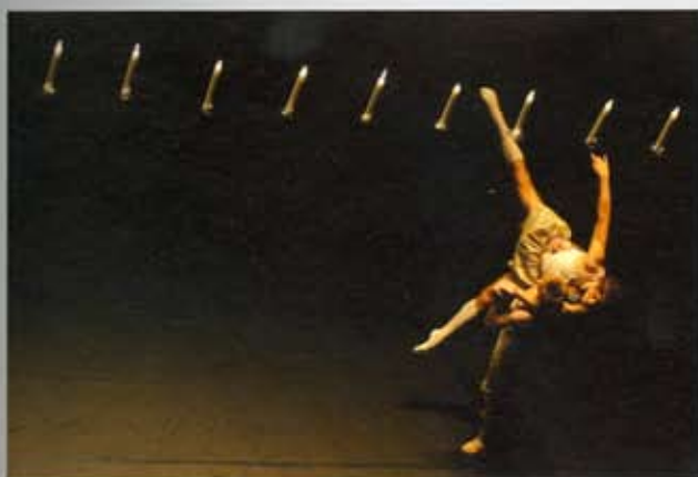
Altro Canto 1